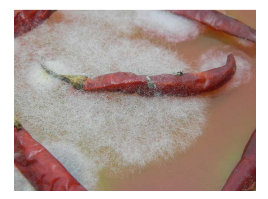
Figure 2. Fusarium and Aspergillus association in red chilli samples.